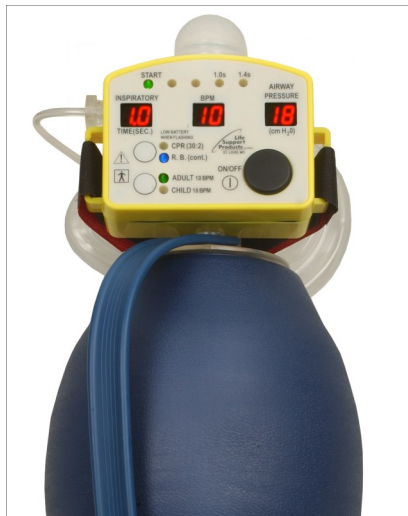
ResusciTIMER shown attached to an LSP L770 adult bag valve mask with the L770-CPR-VEL Velcro Strap

The ResusciTIMER is an affordable and effective tool for mass casualty preparedness, everyday transport, or training. This simple yet effective device assures caregivers of every skill level that they are providing manual ventilation with perfect technique.