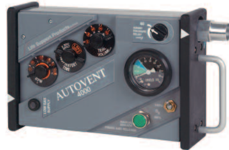
AutoVent™ 4000 Ventilator