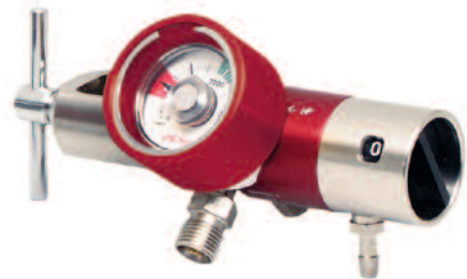
Rhino™ Oxygen Regulator