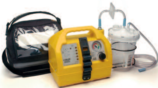
Advantage® Portable Suction Unit